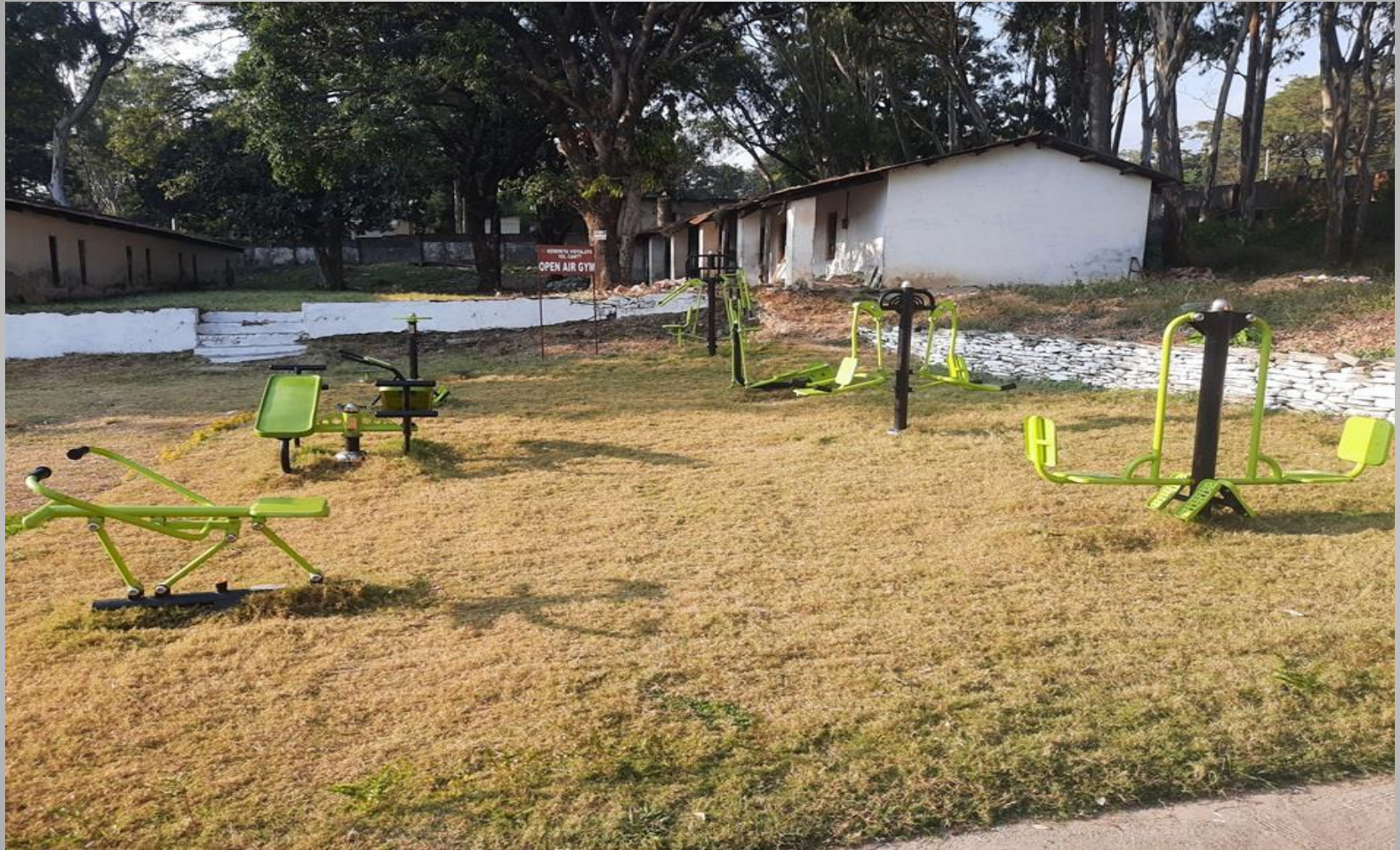
OPEN AIR GYM OF SCHOOL